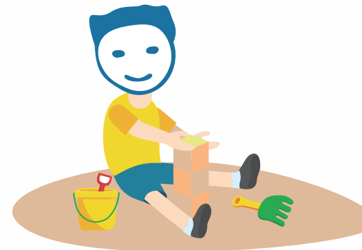
6. Motor Skills Space