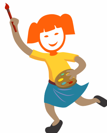
3. Art & Craft Space