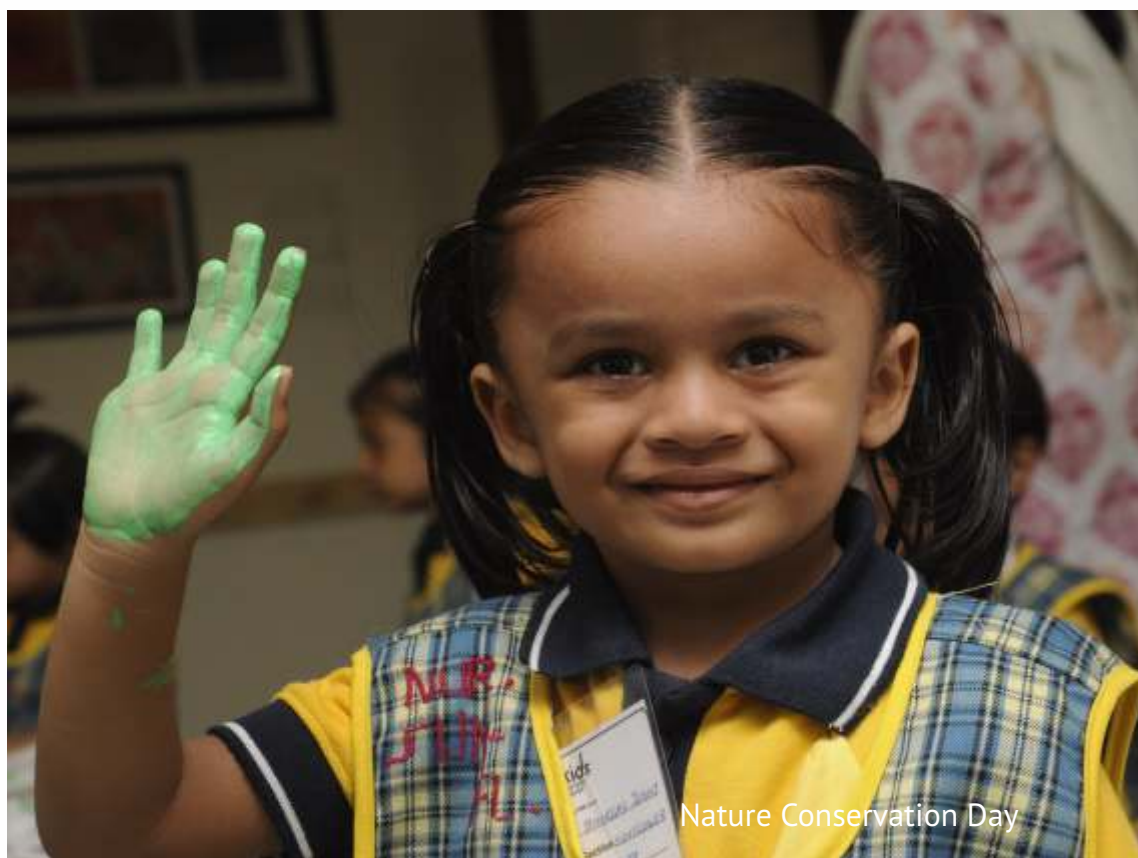
Nature Conservation Day