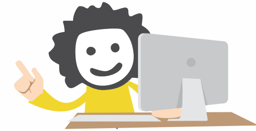
7. ICT Space