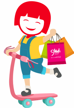
2. Market & Drama Space