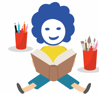
8. Literacy Space