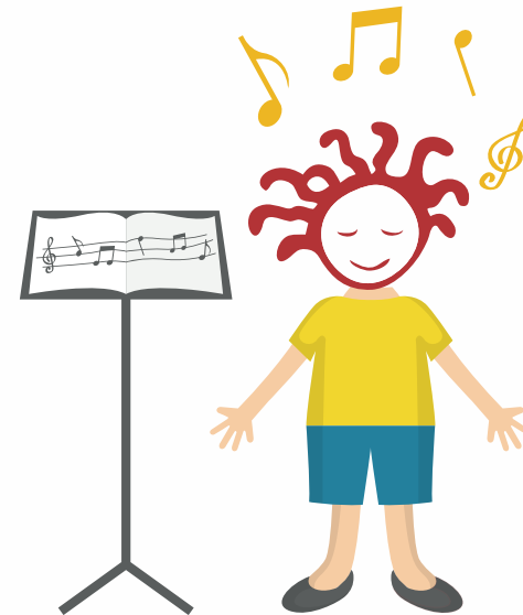
5. Music & Movement Space