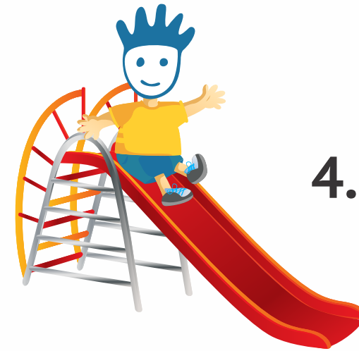
4. Play Space