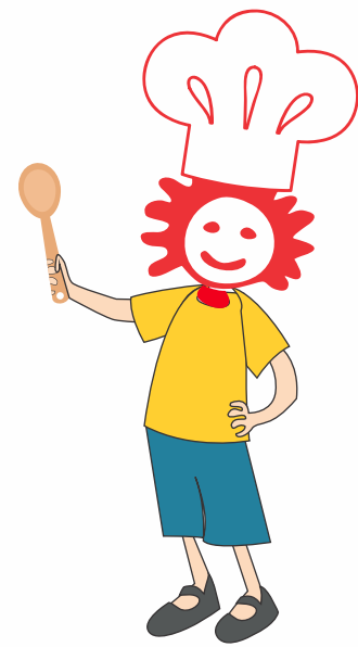
1. Kitchen Space

At 9 Kids, we have 9 stimulating learning spaces, designed to encourage kids to explore and experiment with various things. This helps them deeply understand and relate to the concepts taught in classrooms as well as acquire necessary life skills. We make learning more relevant by conceptualising curriculum around the real world affairs.