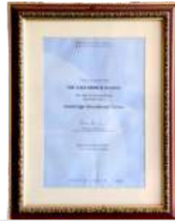
Certificate of Cambridge International Centre