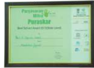
Certificate of Paryavaran Mitra Puraskar