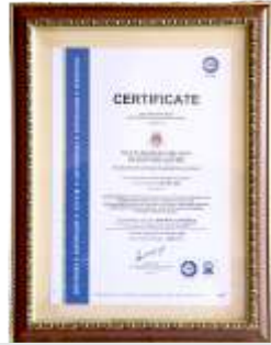
Certificate of TUV SUD South Asia Private Limited