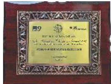
Educational Excellence in Preschool Award for 9 Kids