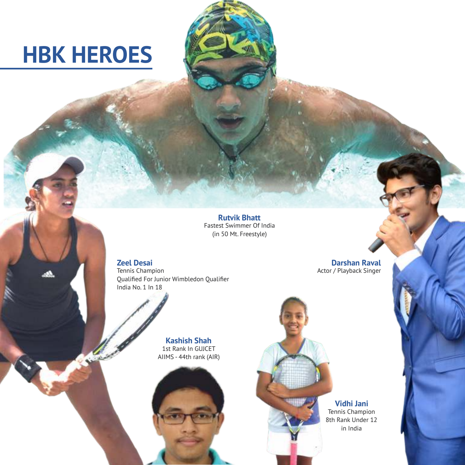
Rutvik Bhatt Fastest Swimmer Of India (in 50 Mt. Freestyle)