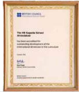
Certificate of British Council International School Award